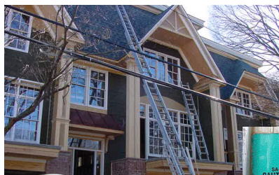
A painter was electrocuted when a metal ladder came in contact with a powerline.

Aluminum conducts electricity. A fiberglass ladder is a better choice when working near electricity.