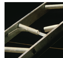
Not every defect is this obvious